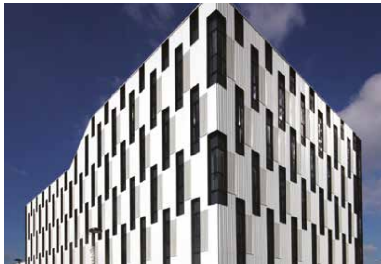
Product Trapeza 7.96.54 /Hairultra Carrare - Architect: 2A Design

www.arcelormittal.com/arval ou http://ds.arcelormittal.com/construction/france/